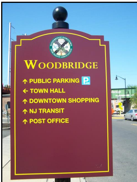
Wayfinding Sign on Main Street