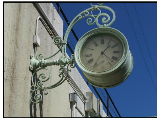
Decorative Clock at Train Station