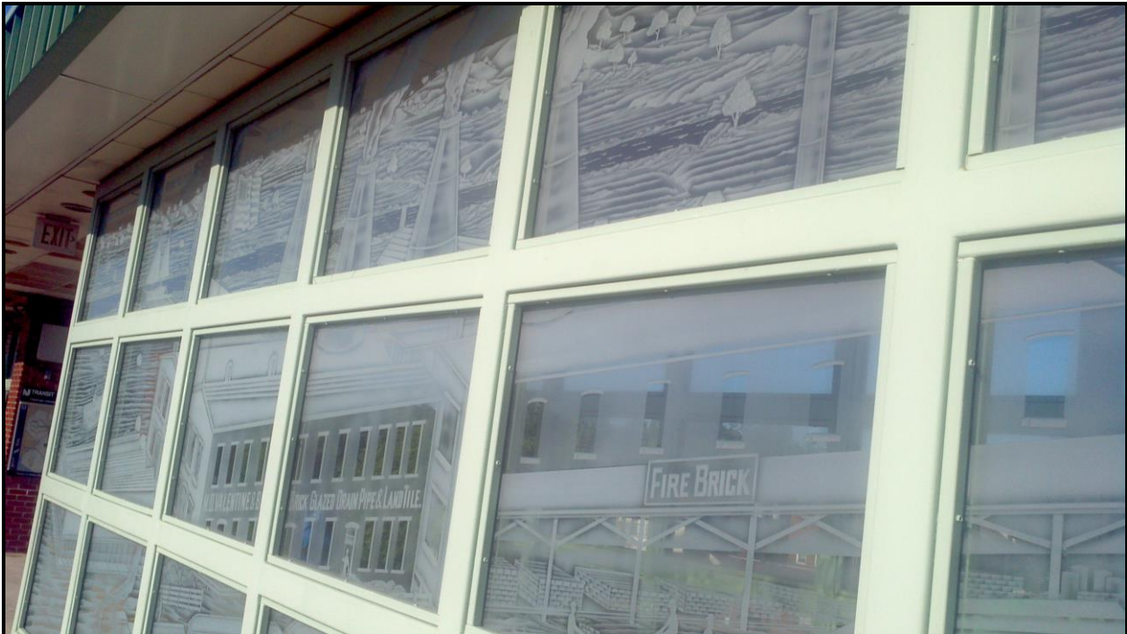
Window Etchings at the Woodbridge Train Station Illustrating the Township's Industrial Past

The Township of Woodbridge is the first incorporated township in the state of New Jersey. The Woodbridge proper section of Woodbridge Township is one of the earliest settled sections of the Township. Woodbridge proper has been the location of the downtown central business district and is where some of the first community facilities were built, such as townhall, schools, fire houses, libraries, and churches. Woodbridge was known for clay mining in the late nineteenth and early twentieth centuries. Woodbridge Center Mall opened in 1971 on the site of a former clay pit.